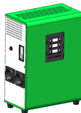
GREEN BOOST 12/24V